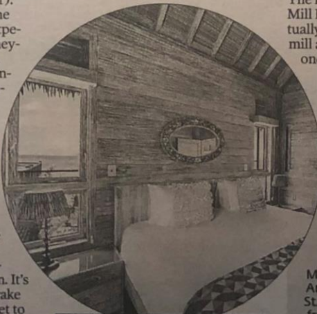
Rooms overlooking the dormant volcano of Nevis Peak catch the tradewinds year round.

The writer was a guest of Montpelier Plantation & Beach.