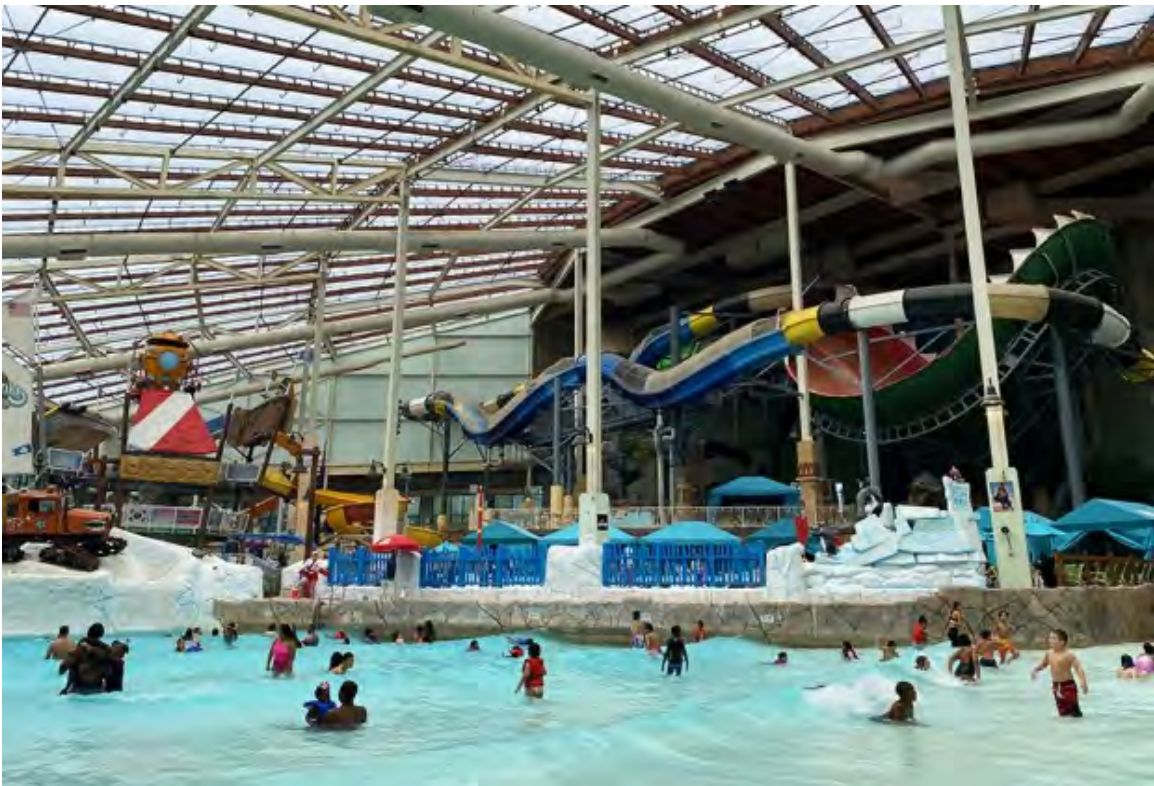
Enjoy the wave pool, cabanas, or 13 water slides at Aquatopia.

The resort's many types of hotel rooms, suites, and accommodations, as well as a multitude of onsite restaurants and rainy day indoor activities like the arcade and bowling, make it easy for families of all sizes and interests to book a room, and well, stay a while!