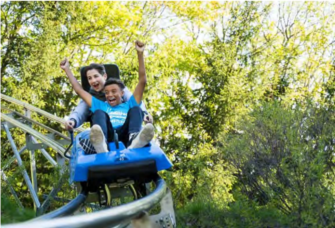
Catch a mountain coaster ride at Camelback! Younger kids can ride with a parent.

Market stand. Casual fare is found at the Trail End Pub where you're also served up a view of the mountain. Find the firepits just outside this restaurant, as well as a shortcut to the trail that leads to the slopes and the various summertime mountain adventures. We also splurged on a nice dinner (and cocktails) served on the outdoor deck at Berrelli's Italian Chop House. Elsewhere onsite, you'll find tacos, a smokehouse, candy shop, pizza spot, and plenty of kid-friendly burgers and fries.