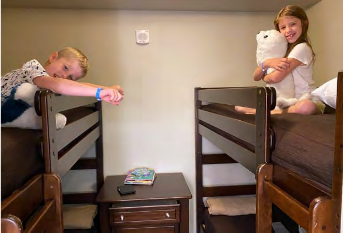
A bunk bed room made for comfortable stay for our family.