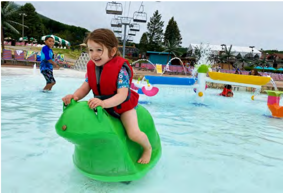
Even toddlers can enjoy the resort's water park!

There's a wave pool, activity pool (meaning basketball hoops), a fairly small toddler splash area, 13 water slides of varying speeds and thrill levels, and at the center of it all, a multi-level, water playground with dumping buckets, water sprayers, shallow splash zone, and all the best slides for kids under the age of 10 or 12. Cabanas with servers, concessions, lockers, towels, and plenty of bathrooms make it easy to spend the day here with your family. The arcade area is just outside the water park doors, too, which is tricky, because you'll have to walk right through it to get inside. I found it hard to drag my kids away from this area!