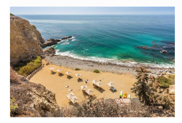
Beach cove at Terranea.

Nestled into the hillside of the Palos Verdes Peninsula, Terranea takes on a dreamy, Ozlike quality as you approach it. The beautiful drive is reminiscent of traveling along the Amalfi Coast and, once you arrive and receive the warm welcome that makes you feel like you've arrived home, you'll immediately relax. You'll feel like you're far away from your daily life even though the Los Angeles and Long Beach airports are only a half hour away.