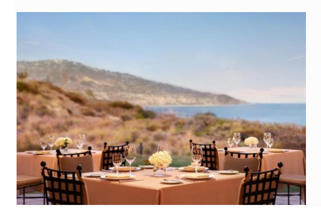
Eating outside at Mar'sel is a double treat.

Before the weather turned, we were lucky enough to have Sunday brunch outdoors at mar'cel, where we were as enamored with the views as we were with the food. The three-course prix fixe meal features so many impossible-to-choose-from options but I went with the chicken and waffle, which was out of this world. And that was just one course!