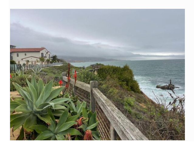
Terranea is even more dramatic when it's rainy.

Nestled into the hillside of the Palos Verdes Peninsula, Terranea takes on a dreamy, Ozlike quality as you approach it. The beautiful drive is reminiscent of traveling along the Amalfi Coast and, once you arrive and receive the warm welcome that makes you feel like you've arrived home, you'll immediately relax. You'll feel like you're far away from your daily life even though the Los Angeles and Long Beach airports are only a half hour away.